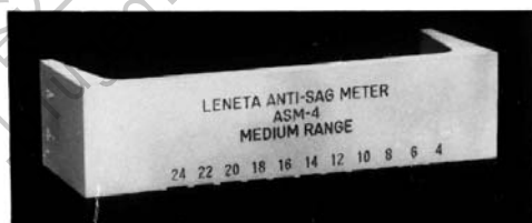
FIG. 2 Medium Range Anti-Sag Meter

drying in this position, the drawdown is examined and rated for sagging. A typical sag pattern obtained by this procedure is shown in Fig. 3.