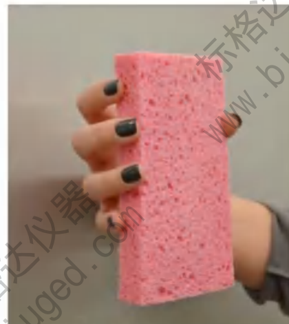
FIG. A2.2 Holding Sponge Vertically

A2.5 If the criterion in Step 4 (A2.4) is not met, a new source of sponge material must be obtained for testing.