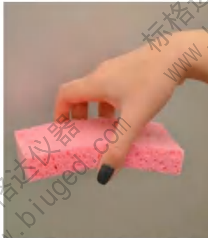
FIG. A2.3 Holding Sponge Horizontally