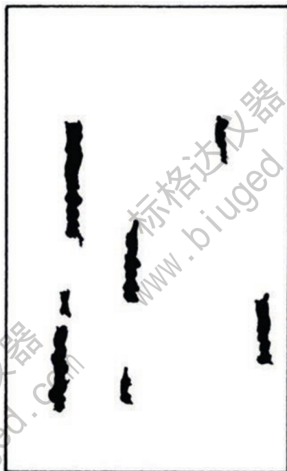
d) Quantity (density) 4