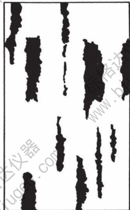
e) Quantity (density) 5