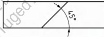
Figure 3 — Recommended method for joining the ends of the abrasive paper strip

It is recommended that the strips of abrasive paper be cut at an angle of 45° and joined respectively when adhering (see Figure 3).