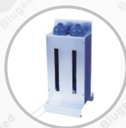
Water Container + Shelf