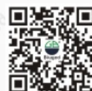
Scan for video