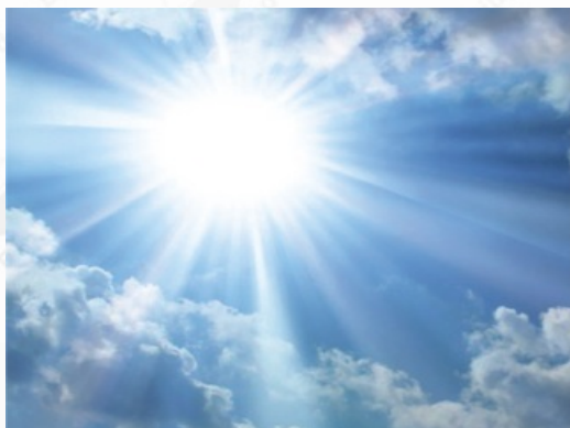
Simulated Sun with full spectrum

Based on sample holder type, B-SUNS are divided into flatbed type and rotating drum type.