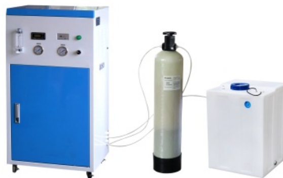
BGD 8170 Purity Water Machine