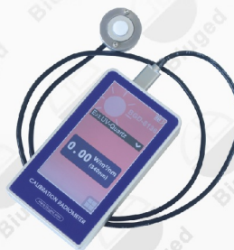
Xenon Calibration Radiometer