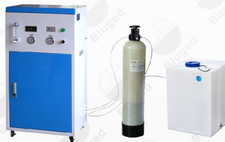
BGD 8170 Purity Water Machine