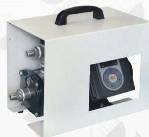
Pure ( deionized ) water machine.