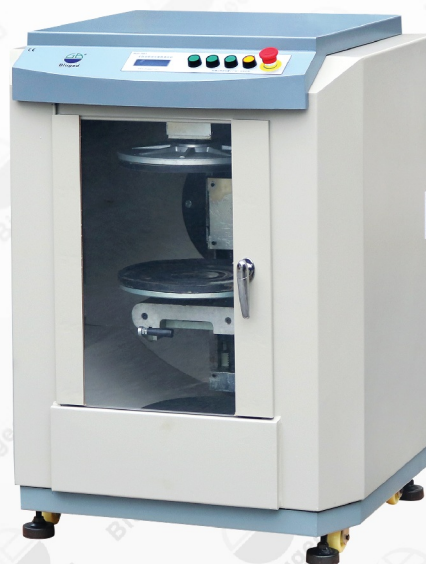
BGD 764/3 Auto. Closed Paint Mixer